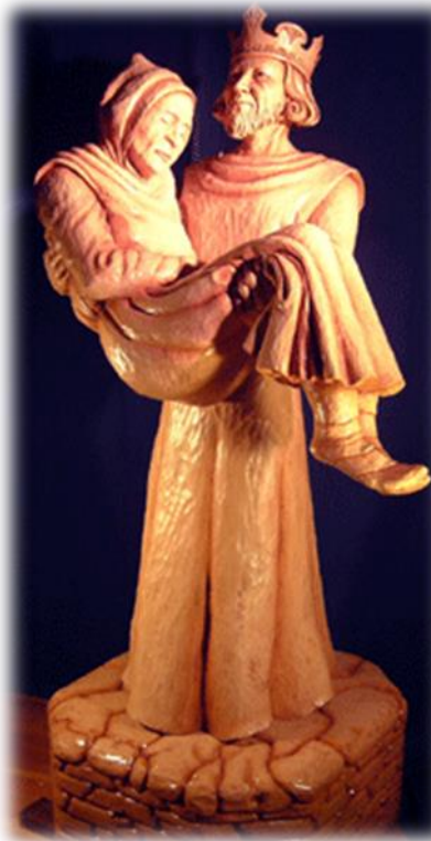
St. Edward the Confessor